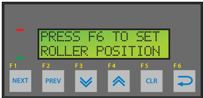
Figure 3: Press F6 Once the Carrier is in the Correct Position