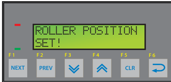
Figure 5: Message Displayed Once Position is Confirmed