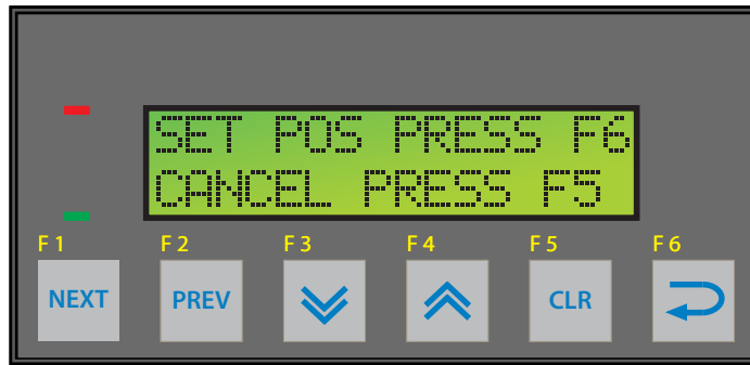
Figure 4: Press F6 Again to Confirm Correct Position